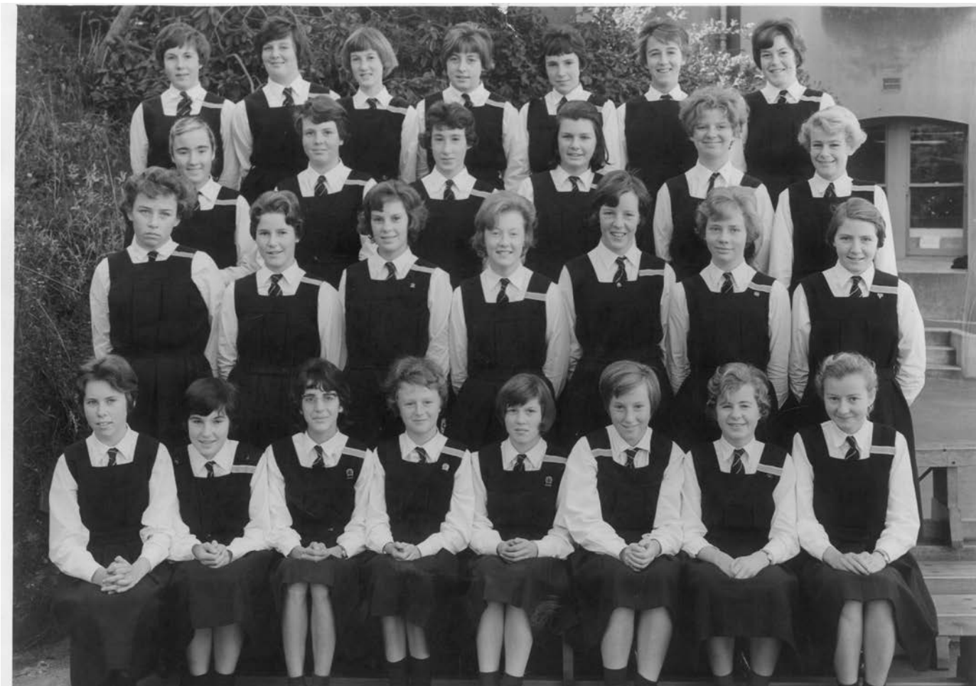
Photograph 4 (below) IIIP