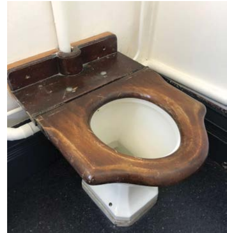
Right: Ethel Benjamin's original and newly refurbished toilet in the Court building.