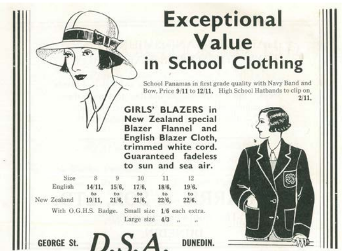
Advertisement for the OGHS uniform in the 1933 school magazine.

Unfortunately due to postage costs the packs cannot be posted out to ex-students.