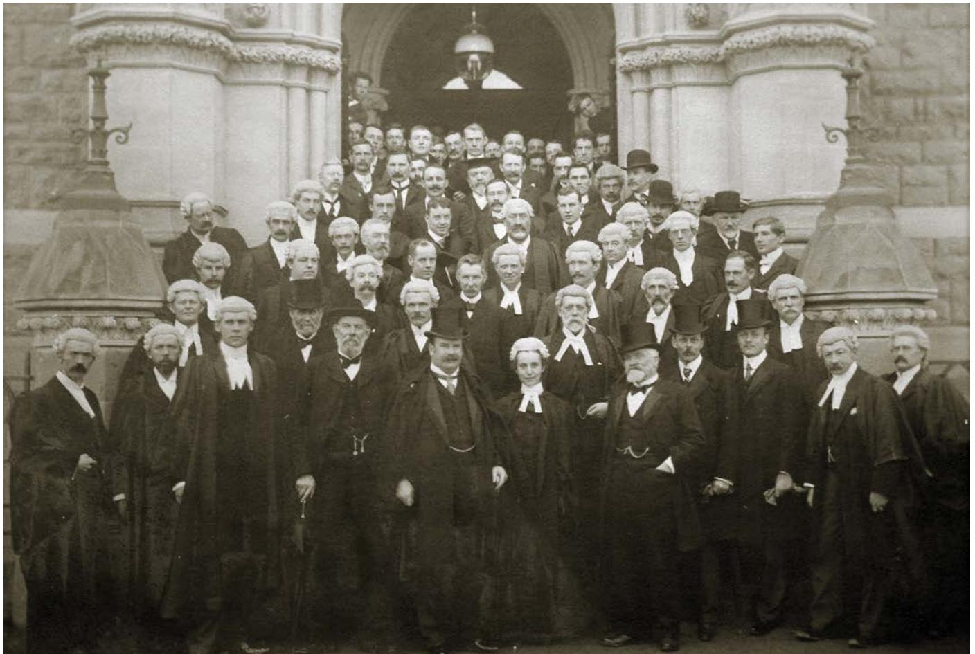
Ethel Benjamin (centre front) at the opening of Dunedin Law Courts in 1902.