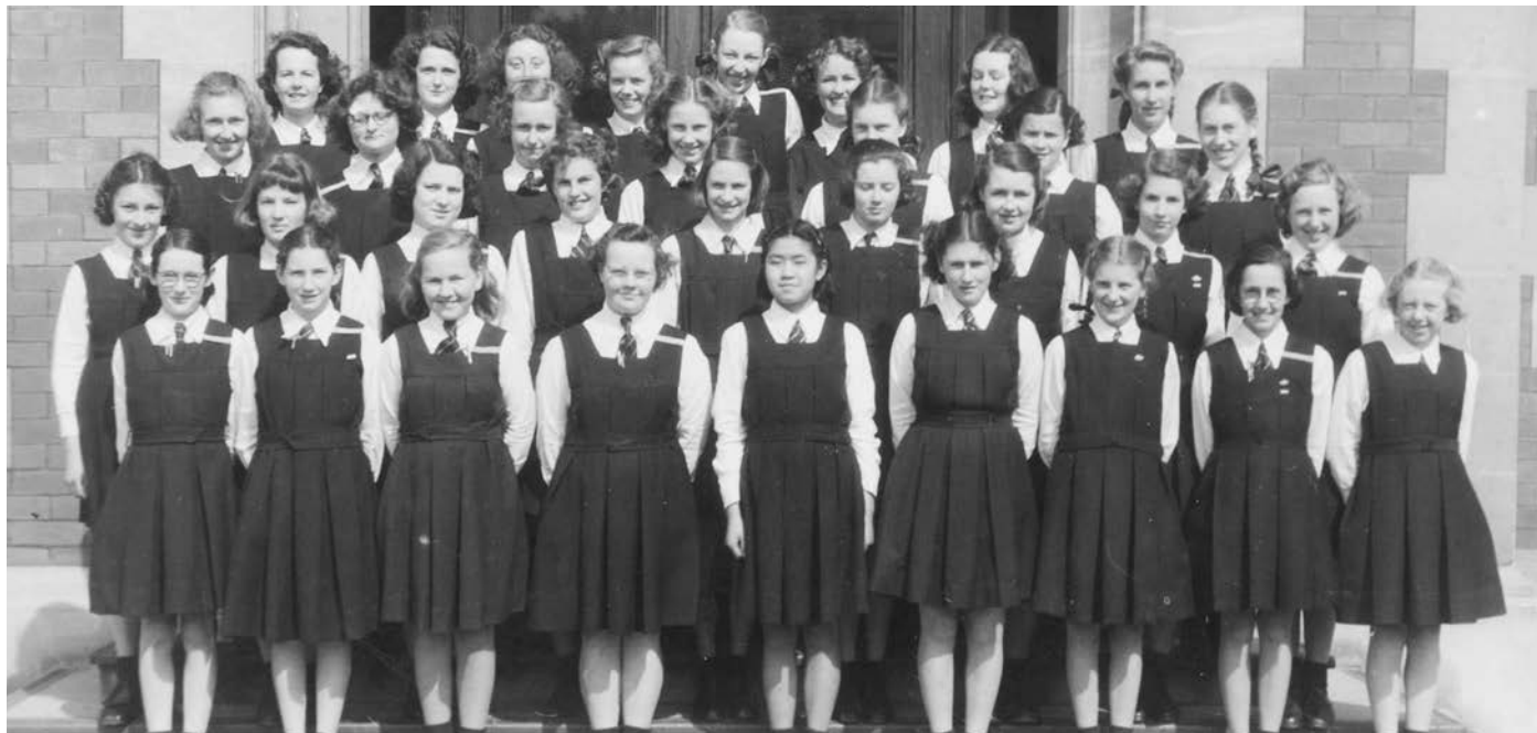
Photograph 2 (below) VIB SC