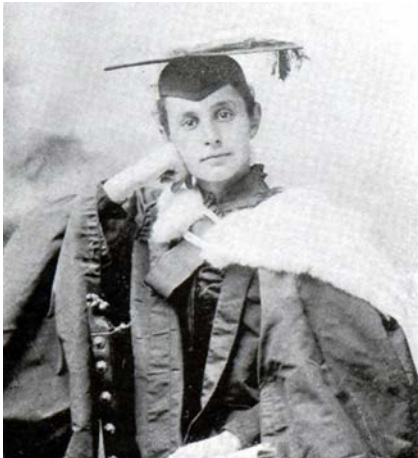
Left: Ethel Benjamin's graduation photograph taken in 1897.

Earlier this year the building reopened after a $20 million upgrade and while many parts have been updated Ethel Benjamin's original toilet remains. Ethel Benjamin was the first woman in the British Empire to appear as counsel in court, and courtroom folklore suggests that this toilet was originally for her sole use and is still referred to as Ethel Benjamin's toilet.